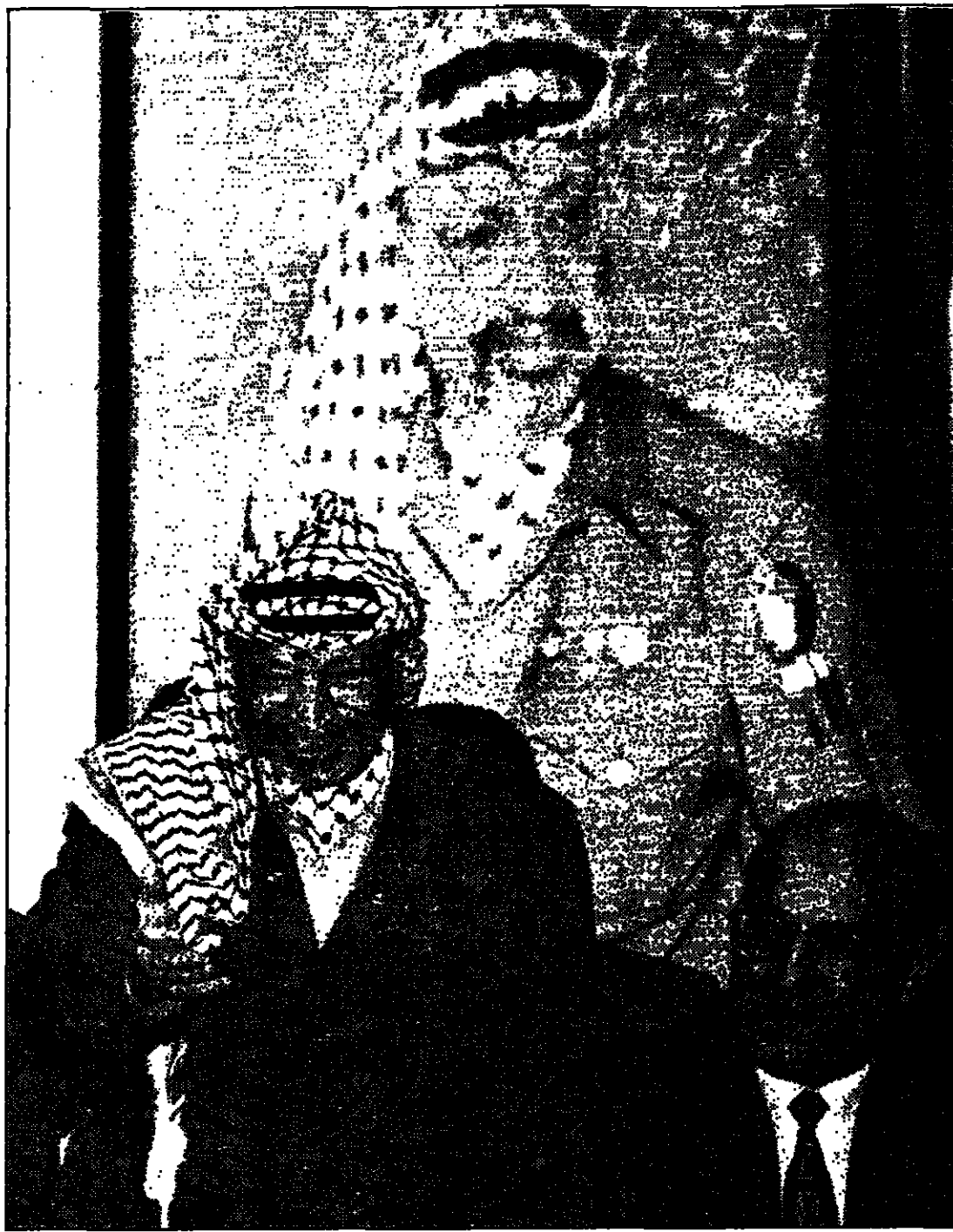
Palestinian Authority President Yasser Arafat speaks at a meeting with USAID in Nablus yesterday, as Planning Minister Nabil Shaath looks on.

There are two reasons for the German involvement. One is a genuine desire to help Israel. The other, however, is the desire of the Germans to save their consciences for their intensive economic relations with Iran. The German government has frequently rationalized its contacts with Iran by saying it uses them to seek the release of Israeli MIAs.